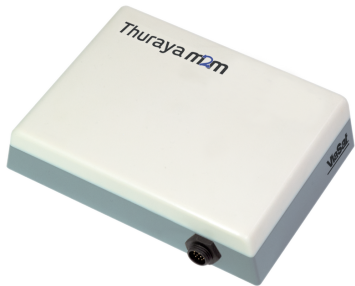
Thuraya M2M - FT2225